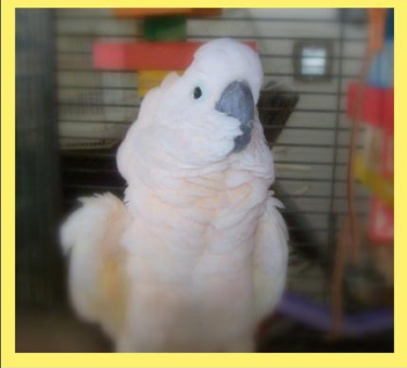
Sasha - 2 year old Moluccan Cockatoo

Sasha is an escape artist!!!!. She escapes to be snuggled and for attention. She is a bird that demands attention and will get it anyway she can. She will eat anything. Wood ,plastic, cords, walls...So needless to say she needs